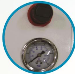
▲ Adjustable Ink-Cup Pressure