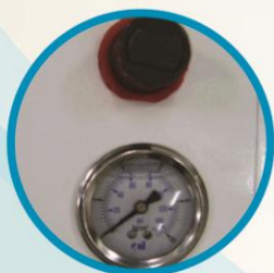
▲ Adjustable Squeegee Pressure