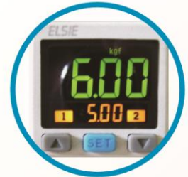
▲ Electronic Pressure Sensor